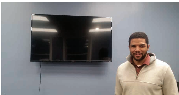
New TVs in Beacon Hall and Youth Room