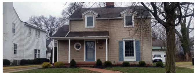
Parsonage maintenance and upgrades, including lawn and landscaping, electrical and plumbing, windows – Riverwood, first floor updates – Kingsbury