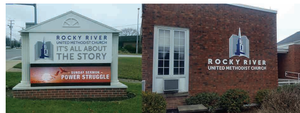
Capital improvements, including roof repair and maintenance, signage: inside and out, new carpeting in sanctuary, installation of new security system