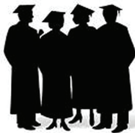
Scholarships, 12 given out over the two years