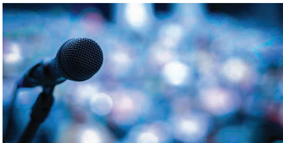
New microphones in all three worship spaces to meet FCC compliance