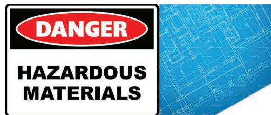
Hazardous material study and site survey with digital blue printing to prepare for future