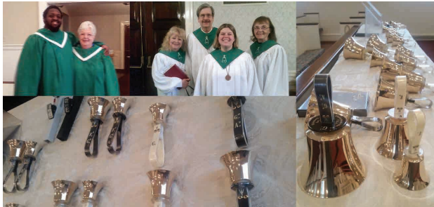
Music: Bells refurbished, new robes for choir