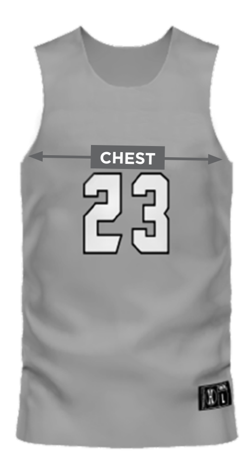
The basketball jersey is designed to be longer so that it will stay tucked into the jersey. Choose the size that best fits the chest.