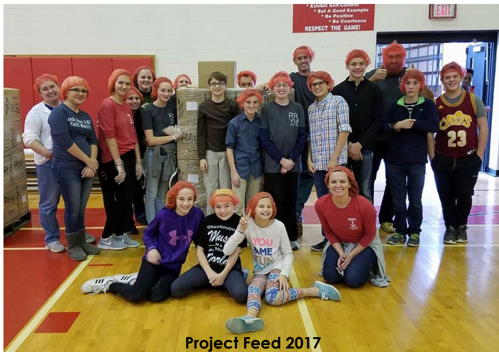
Project Feed 2017