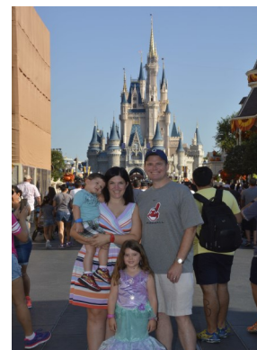
Ellen Polston Sanctuary SS K-2