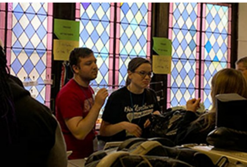
Members of the Cleveland Alumni Club of Ohio Northern University volunteered at the Twice Blessed Free Store in Cleveland, Ohio, on Feb. 10.

Donate: Winter is in our rearview mirror! Spring is here and Summer approaches! Please adjust your clothing and small household item donations to TBFS accordingly. Check out the weekly bulletin to see what items are currently in high demand. You can donate at RRUMC during normal weekday hours or at TBFS on Mondays from 10:00am to 1:00pm or Saturdays from 9:00am to 1:00pm.